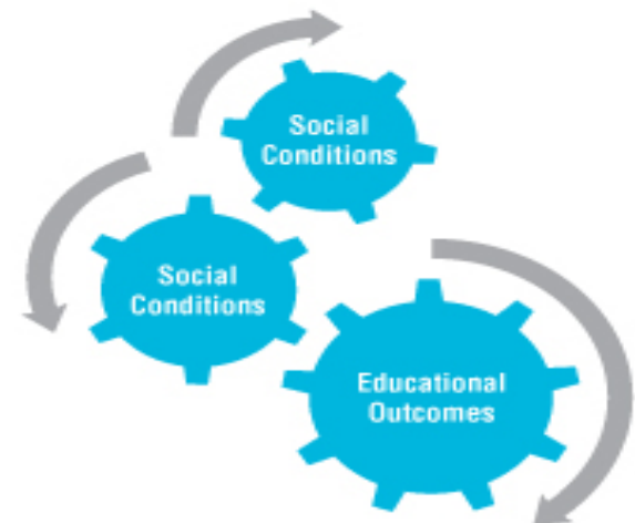
Exhibit 2 Cogs of Social Conditions and Educational Outcomes