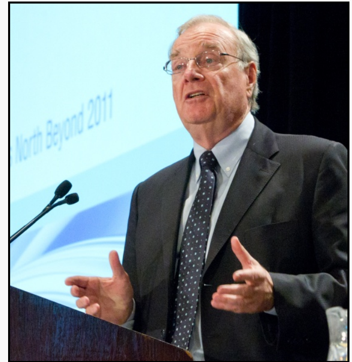
The Right Honourable Paul Martin speaking at "Canada's North Beyond 2011"